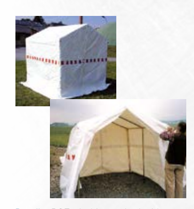
Details: PSE-clothing on both sides coated with PVC, circa 600g/qm, durable against rotting Colour: white/translucent Frame: Steel, 32/1.5mm, passivated, foldable