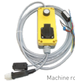
Machine room station