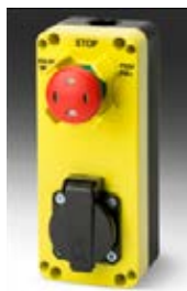
Pit control unit