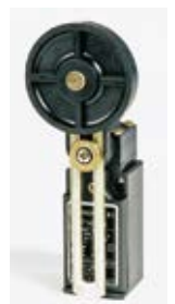
Limit switch with large roll