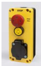
Pit control unit