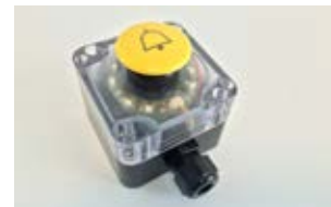
Emergency call button + LED/ buzzer