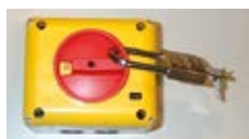
with casing, lockable