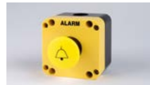
Emergency call button