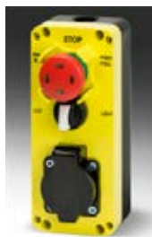
Pit control unit